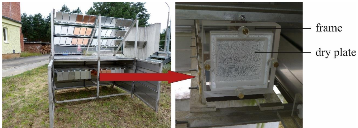
Figure 1. Test rack for exposure studies of standard test samples at the BAM Test Site for Technical Safety TTS equipped with dry plate method.

The dry plate method according to ISO 9225, Annex E, uses a rain-protected two-layer gauze (= dry plate) with a known area. The dry plate is clamped in a collection frame and exposed to the atmosphere in a sheltered or roofed area. After exposure the amount of chloride is chemically analyzed. Figure 1 shows a chloride trap using the dry-plate method on an exposure test rack for standard samples of the Bundesanstalt für Materialforschung und -prüfung (BAM) in Berlin, Germany.